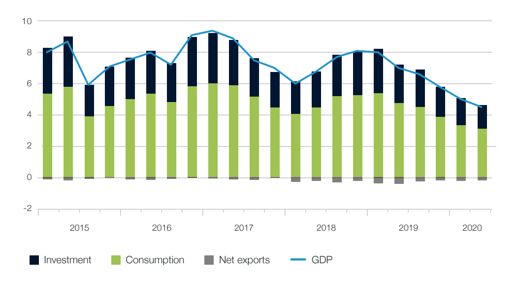
Fig. 32 GDP growth