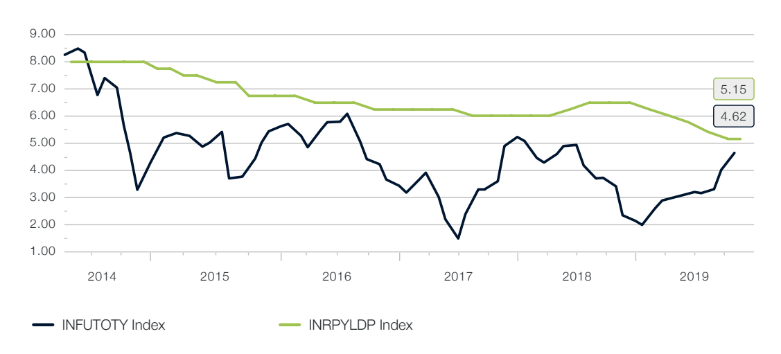
Fig. 35 RBI lowered the interest rate by 135 basis points to 5.15% in 2019

period. Despite the short-term weakness in growth, the Indian economy has structural advantages: on the one hand, the demographic dividend as the basis for solid domestic demand and, on the other, the government's willingness to invest in infrastructure. A GDP of five trillion US dollars may not be achievable for India in five years, but it can be achieved in eight to ten. India offers a wealth of investment opportunities.