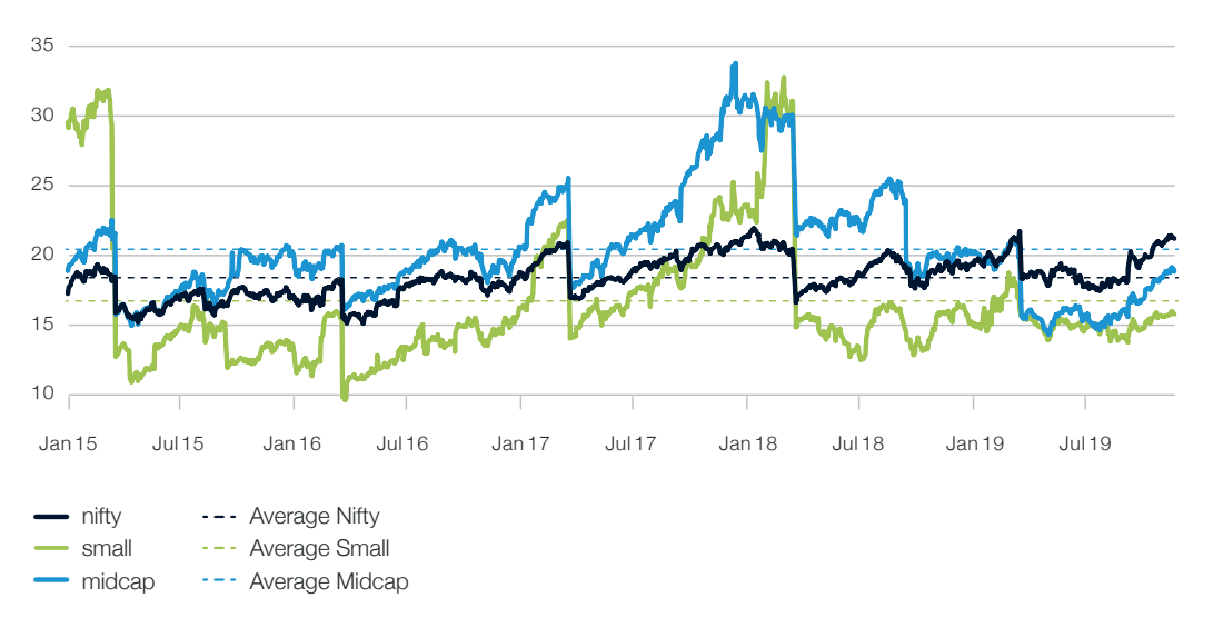
Fig. 36 The gap between SMEs and the Nifty Index is set to narrow in the first quarter of 2020

The euphoria triggered by the reduction in corporate income tax will soon subside; reason and thus the view of fundamental data shall prevail. The market will soon realise that the high valuation of the large caps does not justify the low valuation of the remaining securities. Since the underperformance is totally exaggerated, it can reach tipping point at any time. Small and mid caps have suffered the most since January 2018; their price-earnings ratio has fallen sharply since then.