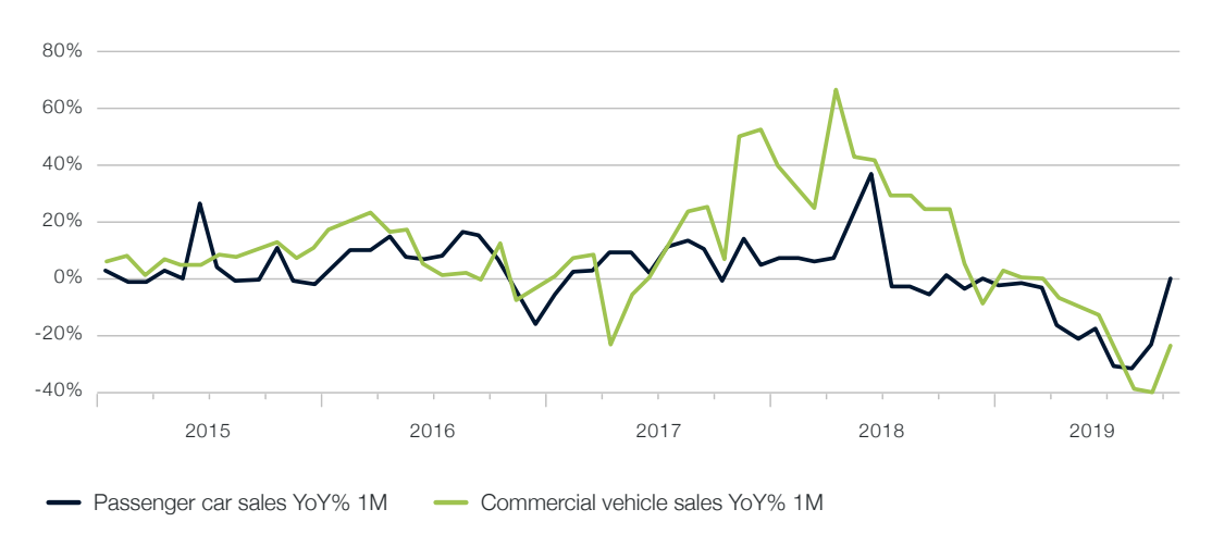
Fig. 33 Automobile consumption will recover in the second quarter of 2020 after a slump

sales of two-wheelers, which reflect the economic development in rural areas, fell by 16%. This illustrates the difficulties of the urban and rural economy on the one hand, also the changed consumer behaviour of millennials on the other.